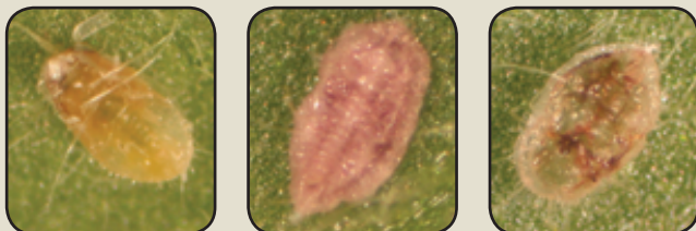
BotaniGard - treated whitefly nymphs