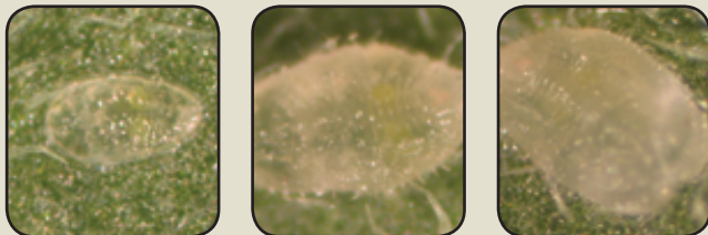
Untreated whitefly nymphs