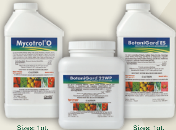
Sizes: 1pt, 1qt, and 1gal.

BotaniGard's mode of action is unlike any conventional insecticide. The applied spores infect directly through the outside of the insect's cuticle (the skin). Spores adhering to the host will germinate and produce enzymes that attack and dissolve the cuticle, allowing it to penetrate the skin and grow into the insect's body. As the insect dies, it will change color to pink or brown, and eventually the entire body cavity is filled with fungal mass. The most common visible indication of insect death is a discoloration of the larvae or pupae. It is not necessary for a white fungal growth to occur to know the product is working; the insect is killed before this happens.