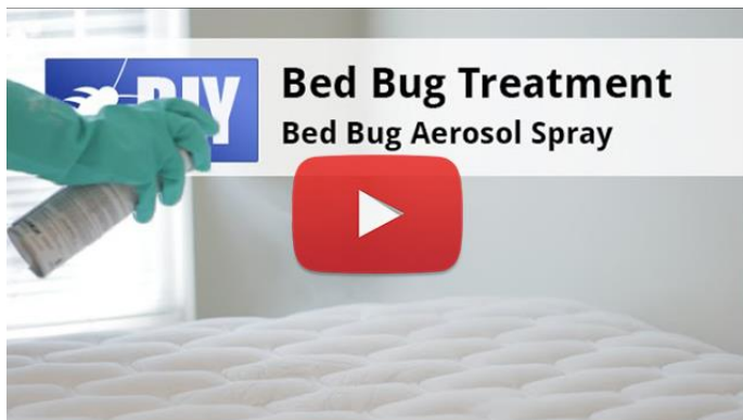
Bed Bug Treatment Video Available on DoMyOwn.com

Bed bug aerosol sprays come with a straw applicator to make it easier to apply into the cracks and crevices of furniture and mattresses around the affected rooms. Don't forget to apply in drawers, picture frames, bed frames, and any other cracks you can find. You will want to allow this part of the treatment to dry before moving on.