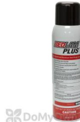
Bedlam Plus Aerosol

Bed bug aerosol sprays come with a straw applicator to make it easier to apply into the cracks and crevices of furniture and mattresses around the affected rooms. Don't forget to apply in drawers, picture frames, bed frames, and any other cracks you can find. You will want to allow this part of the treatment to dry before moving on.