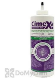
CimeXa Insecticide Dust