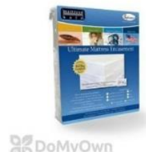
Mattress Safe Sofcover Mattress Encasement