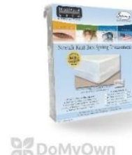
Mattress Safe Stretch Knit Box Spring Encasement