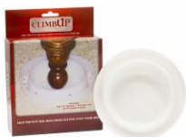
ClimbUp Insect Interceptor