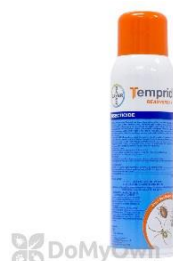
Temprid Ready Spray