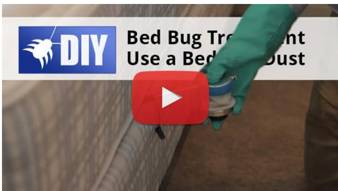
Bed Bug Treatment Video Available on DoMyOwn.com