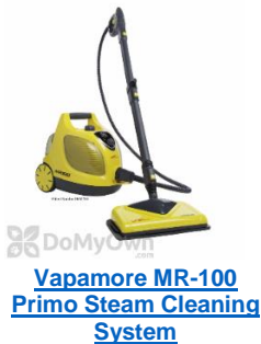
Vapamore MR-100 Primo Steam Cleaning System

This step is optional but highly recommended.