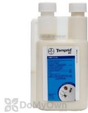
Temprid FX Insecticide

Mix 8-16 mL per gallon of water (or 1-2 bottles)