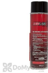
Bedlam Insecticide Aerosol

Bed bug aerosol sprays are insecticides that have fine particles that get deep into cracks and crevices. By using both a liquid concentrate insecticide mixture and an aerosol spray, you can treat bed bugs that may have been missed or built up a resistance to one product but not the other.