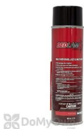
Bedlam Aerosol Insecticide Spray