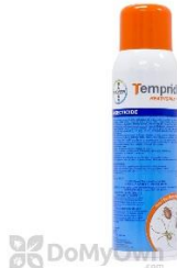
Temprid Ready Spray