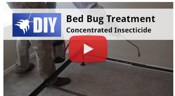
Bed Bug Treatment Video Available on DoMyOwn.com

Repeat as needed. Be sure to read the product label for how often you can safely reapply.