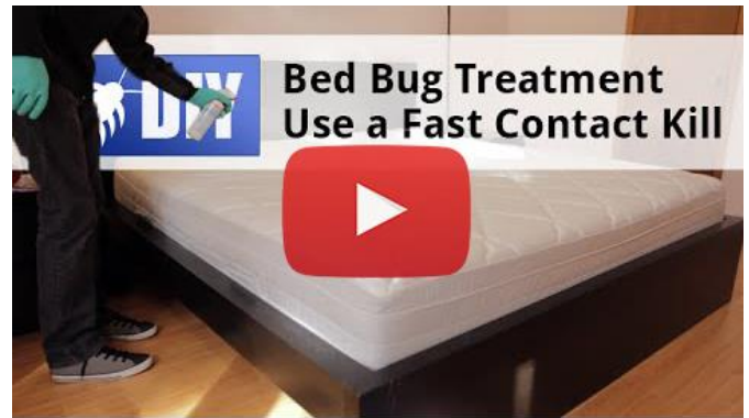
Bed Bug Treatment Video Available on DoMyOwn.com