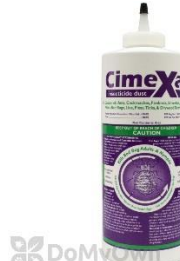
CimeXa Insecticide Dust