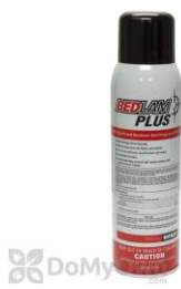
Bedlam Plus Aerosol