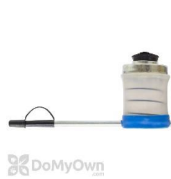
Bellow Hand Duster