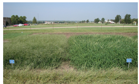
Ardmore, OK 2012. Plots sown on the same day

Mojo now contains Impact™ (Right), a variety released from the Noble Research Institute that heads out 14 days later than Red River (Left).